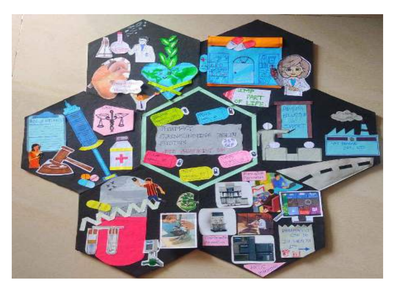
WINNER FOR POSTER MAKING COMPETITION: Gayatri B. Alaspure